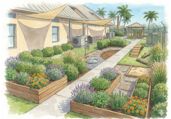
Sensory Garden Concept Rendering

The PBHSN Signature Sensory Garden will be Southwest Florida's premier therapeutic enrichment space for shelter dogs - a beautiful, innovative facility that transforms lives and positions Patty Baker Humane Society Naples as a national leader in progressive animal welfare.